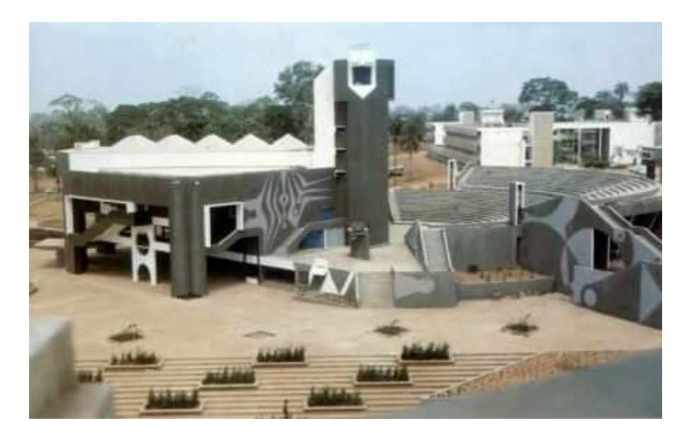
Great !!!! Great !!!! GREAT IFE!!!!

Your alumnus salutes you. Tolu Oladimeji class/set of 1990 salutes you...all! Akiikaa! Unarguably the finest of the class/set of 1990...'Oppressor maximus' salutes you...all lol.